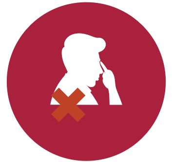
Guji ta fuska