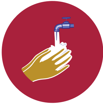
Wanke hannu AKAI AKAI taré sa sabulu

A halin yanzu mutané dubu daya da tasa'in da uku (1093) sun ka kamu da cutar a Nijar Hamcin da bakoye (57) a kan kulawa Muntané sittin da takwas (68) sun rasa rayunkansu Dari tara da sittin da takwas (968) sun warké