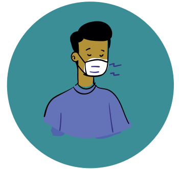
Saka rufe fuska lokacin da ba da lafiya