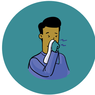
Rufe bakinka da hanci da tchale na zamani. A jefar da shi