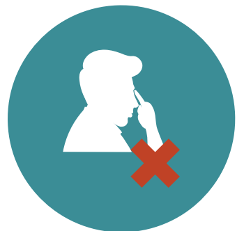
Guji ta fuska