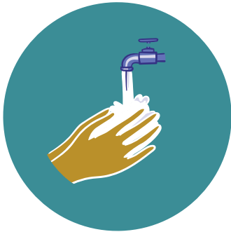
Wanke hannu AKAI AKAI taré sa sabulu

A HALIN YANZOU MUTUN DARI BAKOYE DA TASHIN DA BIYAR (795) SUN KA KAMU DA CUTAR DARI DA HAMCIN DA DAYA (151) A KAN KULAWA ARBAHIN DA HUDU (44) SUN RASA RAYUKANSU MUTUN DARI SHIDA (600) SUN WARKE.