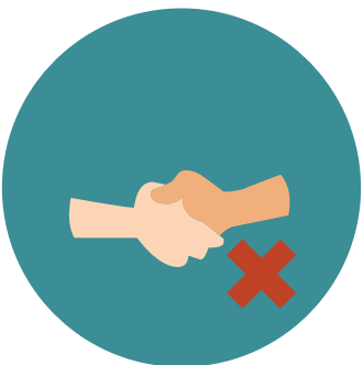
Guji taba mutane