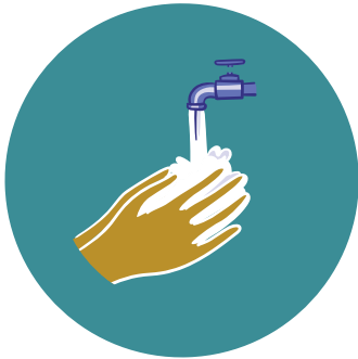
Wanke hannu AKAI AKAI taré sa sabulu