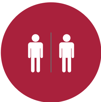
Nisan aminci mita daya (1m)