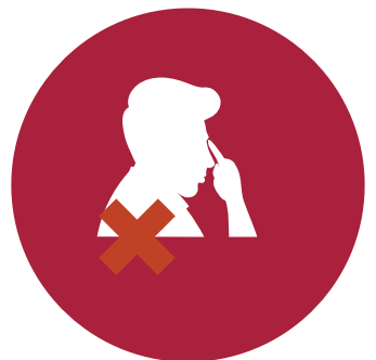
Guji ta fuska