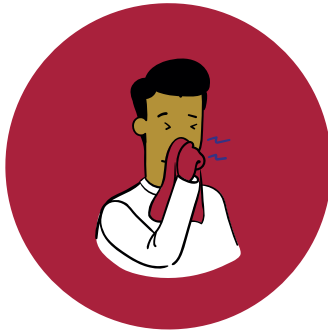
Rufe bakinka da hanci da tchale na zamani. A jefar da shi