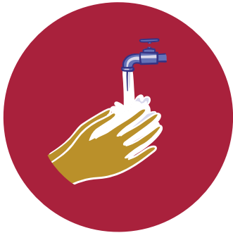
Wanke hannu AKAI AKAI taré sa sabulu

A HALIN YANZU MUTUN DARI TAKWAS DA TALATIN DA BIYU (945) SUN KA KAMU DA CUTAR DARI DA ARBA'IN DA TARA (101) A KARKASHIN KULAWA ARBA'IN DA SHIDA (61) SUN RASA RAYUKANSU DARI SHIDA DA TALATIN DA BAKWAI SUKA WARKE (783) SUN WARKE