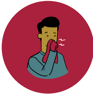
Rufe bakinka da hanci da tchale na zamani. A jefar da shi