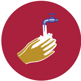
Wanke hannu AKAI AKAI taré sa sabulu

DARI TAKWAS DA SHITIN DA BOKOYE (867) SUN WARKE