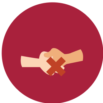
Guji taba mutane