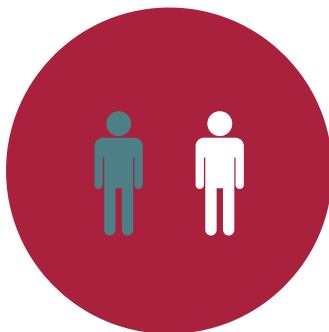
Nisan aminci mita daya (1m)