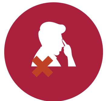
Guji ta fuska