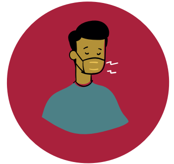
Saka rufe fuska lokacin da ba da lafiya